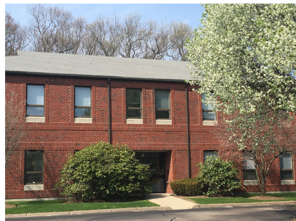
Rhode Island Dental Association 875 Centerville Rd., Bldg. 4, Ste. 12 Warwick, RI 02886

Interested in contributing to the Journal? Contact us TODAY! The next deadline is April 1, 2019